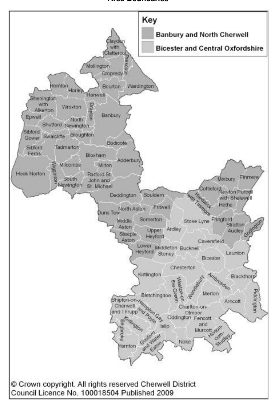
Figure 1 Banbury and North Cherwell and Bicester and Central Oxfordshire Area Boundaries